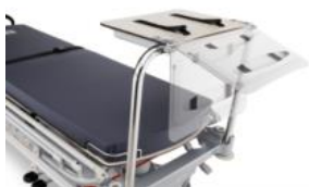
BT0025 -FOOT PANEL AS SHELF FOR MONITOR AND INTEGRATED DOCUMENTS COMPARTMENT