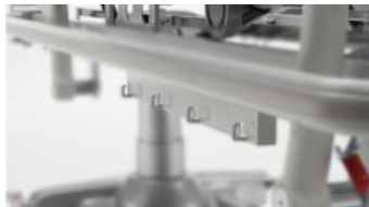
BT0070 -LATERAL BAG SUPPORT ( RIGHT OR LEFT) FOR SLIM STRETCHERS