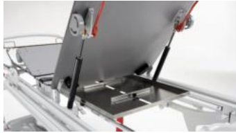
BT0055 -X-RAY CASSETTE FOR SLIM STRETCHERS