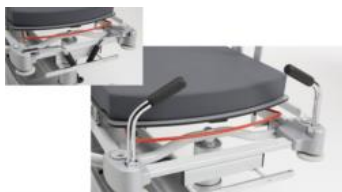
BT0040 -PAIR OF RETRACTABLE PUSH HANDLES FOR SLIM STRETCHERS