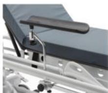
BT0080 -ARMREST TO BE APPLIED ON THE LATERAL ACCESSORIES BAR (BT0075) - FOR SLIM STRETCHERS