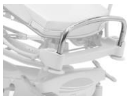
BT0030 -PUSH HANDLE FOR SLIM STRETCHERS