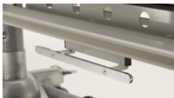
BT0075 -LATERAL SUPPORT FOR ACCESSORIES (LEFT OR RIGHT) - FOR SLIM STRETCHERS