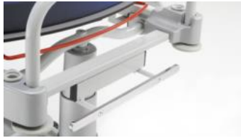
BT0050 -ACCESSORY HOLDER FOR STRECHTER HEAD SIDE