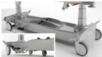
BT0017 -SET 4 WHEELS Ø MM. 200 PLUS 1 Ø 100 MM. FOR STRECHTERS