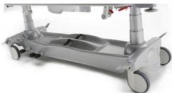
BT0015 -4 SINGLE WHEELS Ø 200 mm, 1 DIRECTIONAL, 2 ANTISTATIC, FOR SLIM STRETCHERS