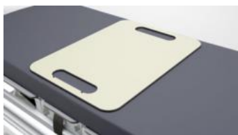
BT0035 -BOARD FOR HEART MASSAGE FOR SLIM STRETCHERS