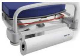
BT0045 -PAPER HOLDER FOR SLIM STRECHTERS