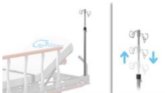
BT0060 -REMOVABLE I.V. STAND, ADJUSTABLE HEIGHT, WITH 4 HOOKS