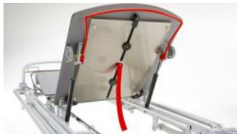
BT0065 -SUPPORTS FOR THE ANCHORING OF THE X-RAY CASSETTE ON THE BACKREST OF SLIM STRETCHERS